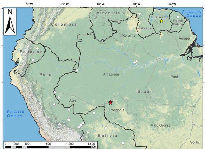
Figure 2. Distribution map for Trachycephalus coriaceus in South America, including the new records from Rondônia (red stars) and the type locality in Suriname (yellow star). Literature records (listed in Table 2) are indicated by white circles.